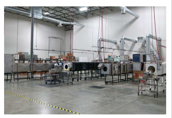
AAF International operates its Clean Air Innovation & Research Center (Clean AIR Center) near its World Headquarters in Louisville, Kentucky.